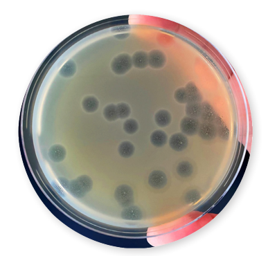
FIGURE 1: Example of plaques on the Petri dish

Somatic coliphages are viruses that infect bacteria such as Escherichia coli . They are ideal indicators of viral faecal contamination in water since they are non-pathogenic to humans, they thrive in the same conditions and exhibit very similar behavior to viruses that are hazardous to humans.